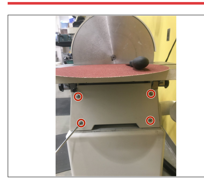
Step 4 — Remove the lower cover.

Using a screwdriver, unscrew the four screws holding in the lower cover. Once the cover is removed, vacuum up any dust.